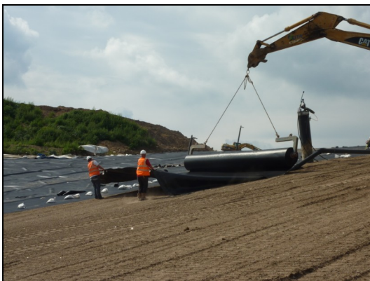
Capping-off with the plastic membrane

Albury Landfill is nearly full, that's the good news. Unfortunately the economic downturn has meant that the tonnage of waste has dropped off and, in consequence, the original date for completion of the site will slip from November this year through to January 2012.