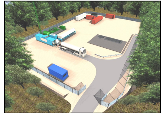
Artist Impression of Albury Well Site

The production process is relatively simple; the gas is cleaned, filtered and then refrigerated. Some gas will be used to generate on-site electricity so that the plant will be self-sufficient. The end result will be a low carbon alternative to diesel, burning more cleanly and quietly, and emitting less pollutants.