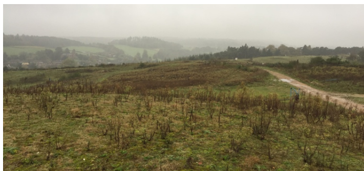
Current view from the landfill site

SITA are now planning a viewing platform so members of the public can walk to the top of the site and enjoy the panoramic views. The platform will face out towards Albury, will be accessed by a footpath and will be fenced along its length, as well as around the platform itself, to ensure visitors are safe. Residents may remember that SITA had originally said there would be no access to the site for 60 years, and we are very pleased that they have now agreed to the Parish Council's request for a viewing platform.