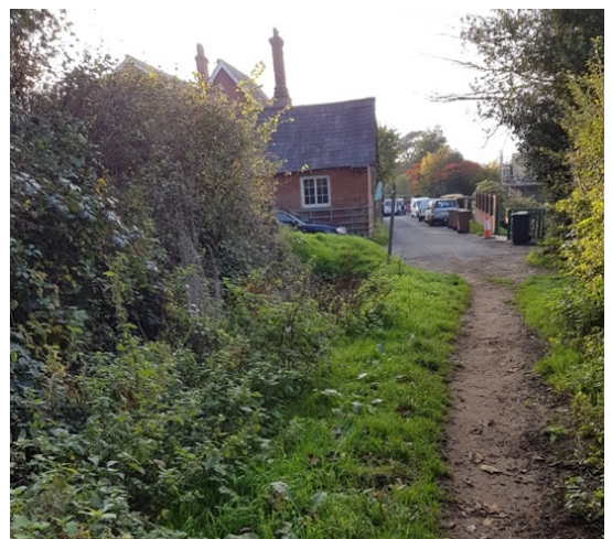
The overgrown ditch in the Warren

There has also been flooding at Farley Green near the pond. We asked the contractor undertaking winter maintenance on the pond to clean the inlet and outlet to rule out any problems. I then investigated a pipe which crosses the road and found a boulder blocking the pipe entrance. Once removed the water flowed and the puddle is drying up nicely. We will put a manhole cover over the end of the pipe to prevent this happening again.