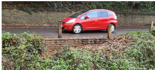
Road repairs in The Street

We are disappointed with the VAS equipment (speed cameras) in The Street. The machine supplied runs on batteries with a very short lifespan and is often not working. This equipment is on loan to us and we are investigating the cost of buying our own more reliable model which could be moved around the parish as needed. We will be analysing the data from the current VAS, (which includes traffic volumes and speed) to help determine traffic calming measures for The Street.