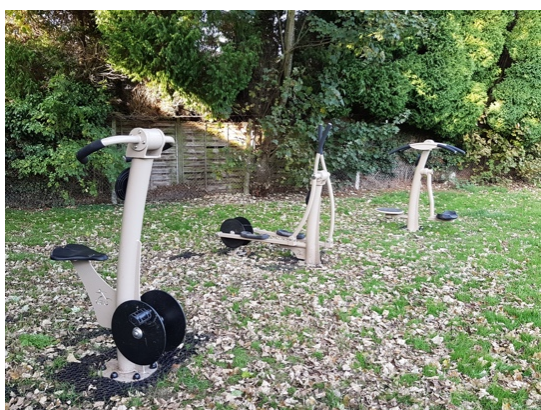
The new outdoor gym at the Recreation Ground

We have installed more new equipment at the Recreation Ground at Weston Fields. There is a new outdoor gym for older children as well as adults, and benches will follow soon. We are also replacing two sets of swing seats and two areas of safer surfacing.