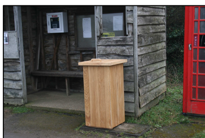
APC Community Development

A new and very handsome green oak waste bin now has pride of place at the bus stop at Farley Green. This replaces the old metal eyesore that has been there for many years.