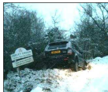
Action shot taken during the last snowfall!