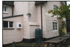
William IV, Little London