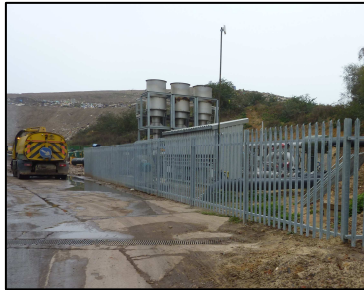
The new Gas Flare Compound

Since the last round of information the gas flare compound has been secured and SITA's Contractors have been pushing ahead with the construction of the leachate treatment plant .