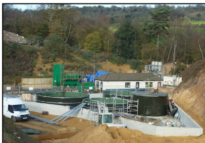
Construction of the Leachate Plant

The capping operation along the village side of the site together with Cell B on the northern side of the site has now finished for the winter and will resume in 2-3 months time, however, SITA will be continuing to fill the remaining void and bringing in top soils to continue with their proposed restoration.