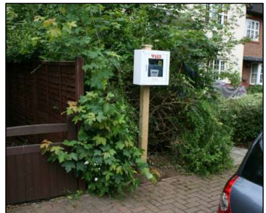
Westonfields car park location.