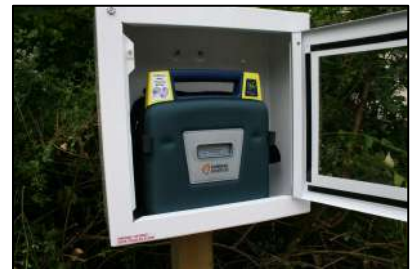
Close-up of the Defibrillator Case.