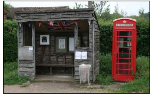
Farley Green Bus Shelter location.