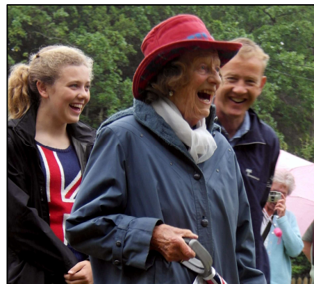
Tree Planting, Albury Heath Diamond Jubilee Celebrations, June 2012