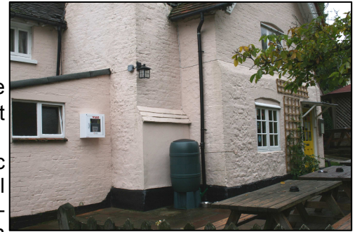
William IV, Little London